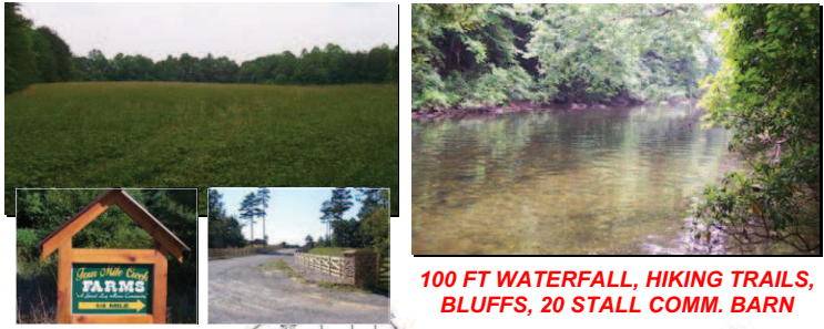
100 FT WATERFALL, HIKING TRAILS, BLUFFS, 20 STALL COMM. BARN